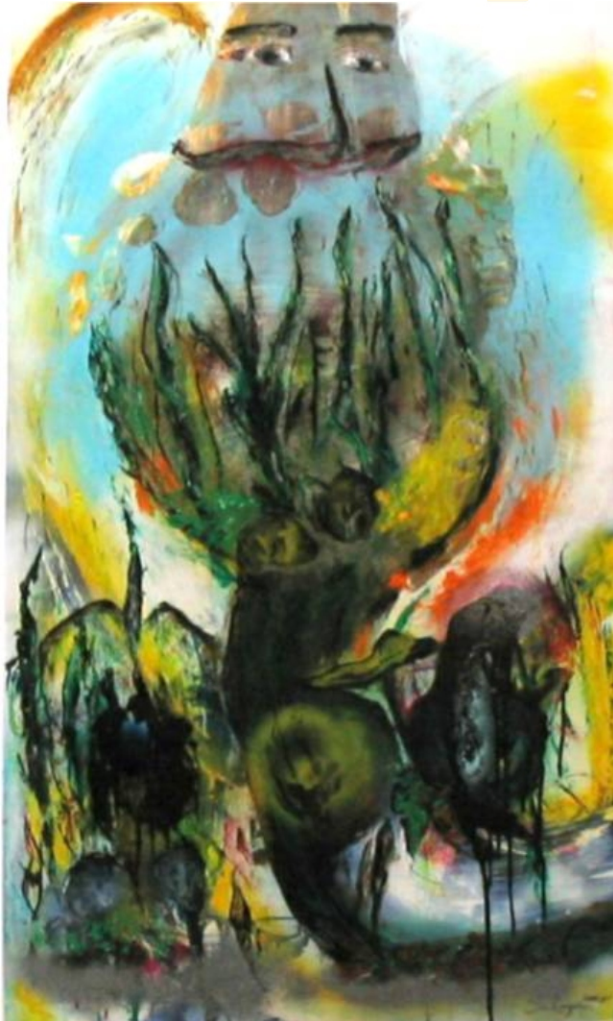
Figure 6 “Talaoc: He Who Makes the Rain”