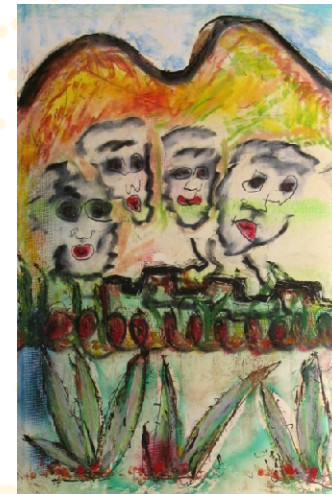
Figure 1 “Environmental Guardians”

this cruel hazard to the future well being here in Mexico came more rapidly than I ever expected. Today, there are parades, conferences and a government program (of sorts) that are attempting to turn things around. A largely rural country with most cities at a high altitude (over 5,000 feet) will enable Mexico to do so if the issue is pursued with vigor by the government and the younger generation now at schools as the 'older' generation are, for the most part, largely a lost cause .