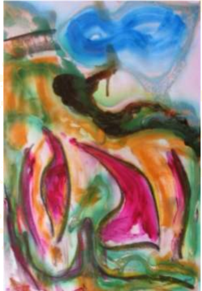
Figure 5 “Gratifying”