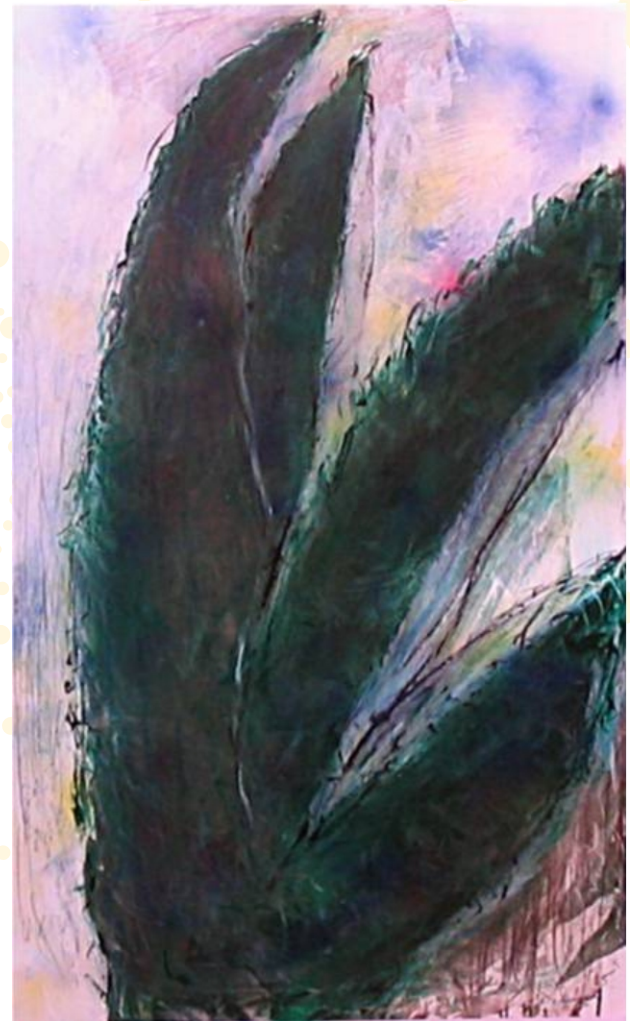
Figure 7 “Agave Azul”