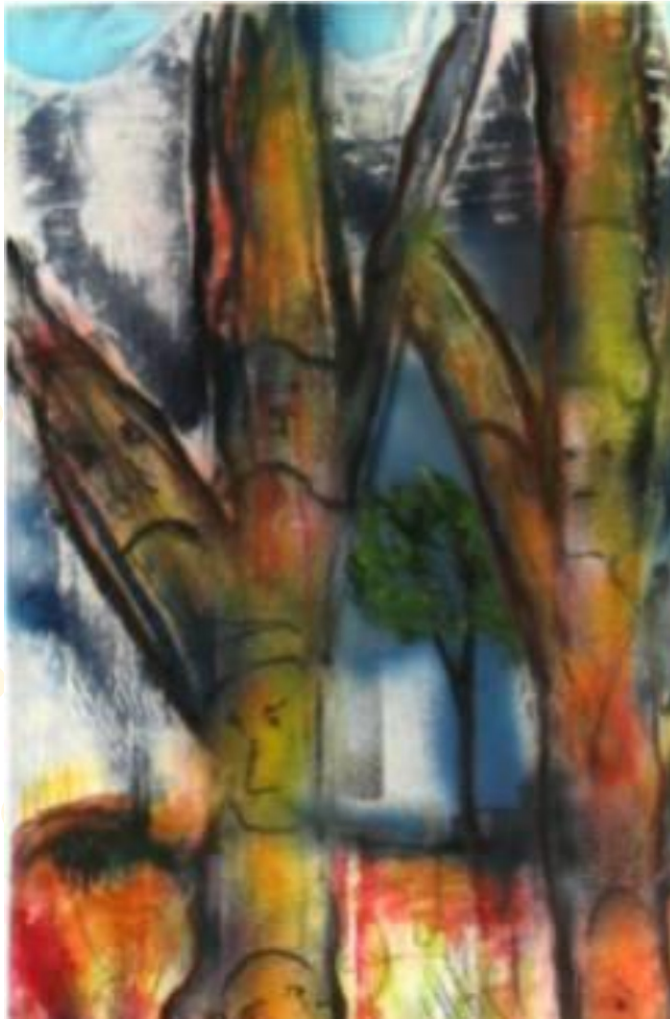
Figure 4 “Wood Nymphs Captured”