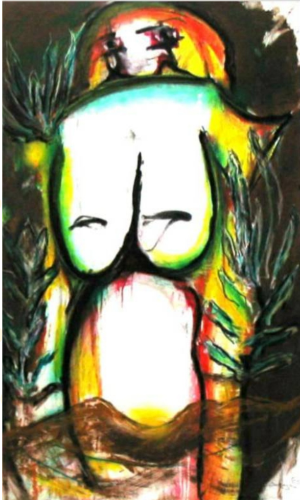
Figure 8 “Goddess Mother Earth Arising”