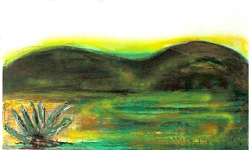
Figure 9 “Green Flash Over the Valley of Mexico”